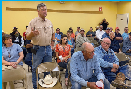
Immigration Concerns in Comstock ... Page 3