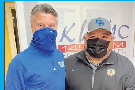
Search Begins for New AD ... Page 10