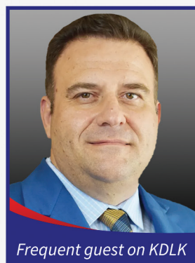
Frequent guest on KDLK

on all legal fees for law enforcement, veterans, first responders and their families