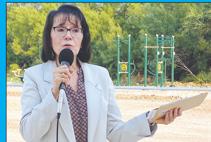
'Field' Donors Recognized ... Page 9